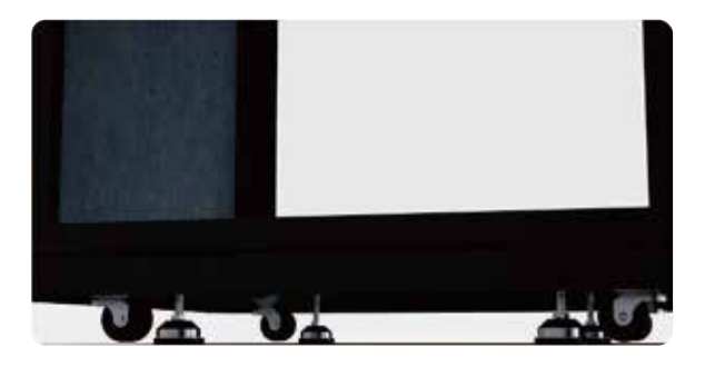
With Wheels And Feet